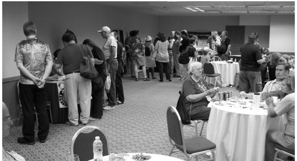
Australia in 2010 bid party