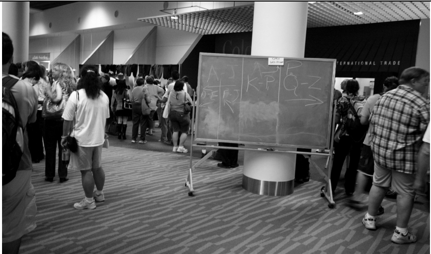
Fans Line Up (Alphabetically) to Register at Denvention

notebook, with a description of the available items, and bid sheets will be at the Information Desk at the CCC. The Auction will close 10pm Saturday and results will be announced in the Sunday newsletter.