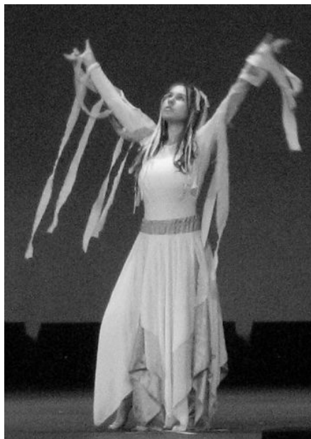
The Artifact—Masquerade Entry