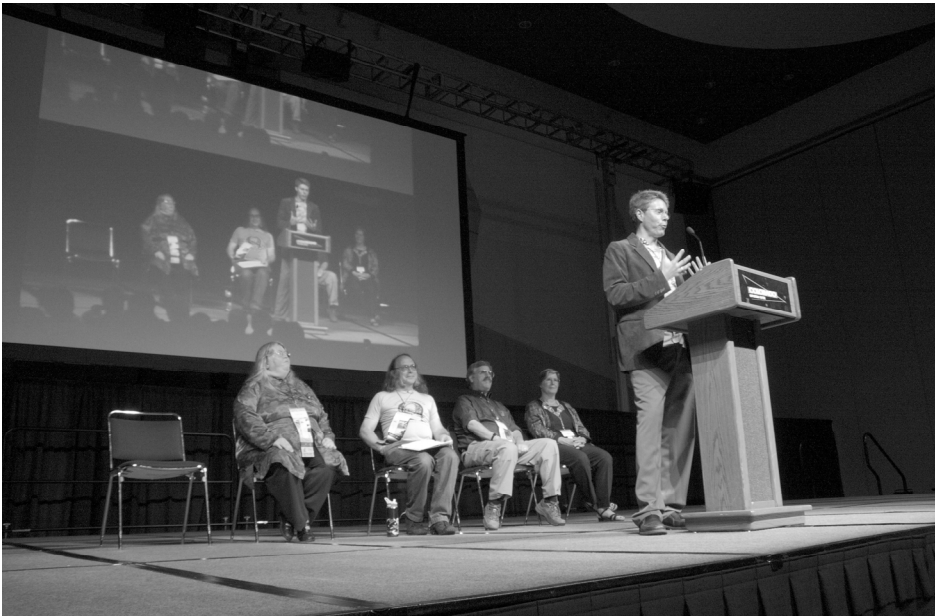
Denvention guests open the convention.