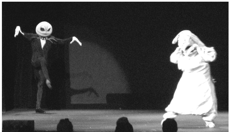
"A Nightmare in Denver"